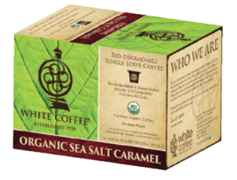
Sea Salt Caramel Buttery Caramel with Hints of Caramelized Sugar and a Touch of Sea salt.