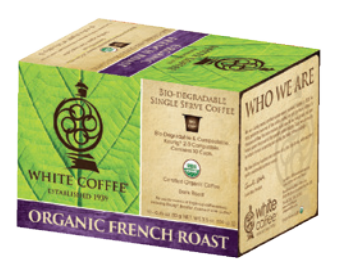
French Roast Intense, Powerful Flavor with a Rich, Strong Finish.