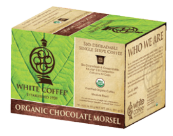
Chocolate Morsel Rich, Decadent Chocolate Flavor. Sweet, Intense Velvety Smooth.

BioCup<sup>™</sup> is the environmentally friendly way to enjoy one cup coffee convenience. With the use of single cup coffee expanding, billions of non biodegradable cups fill landfills each year. This creates multiple environmental issues. The solution: White Coffee's BioCup<sup>™</sup>. The BioCup<sup>™</sup> is both compostable and biodegradable, with 90% degradation after 6 months. Combined with the finest coffees that White Coffee<sup>®</sup> has sold for over 75 years, BioCup<sup>™</sup> provides superior quality in an environmentally friendly, convenient platform.