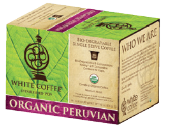
Peruvian Characterized for a Balanced, Creamy Buttery Body with Fruity, Citrusy Notes and a Sweet Caramel Aroma.