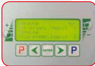
Multi-language display for a constant dialogue between machine and Chef.