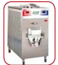
Table Top model