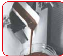
Chute for direct extraction of jams, fruit jellies, chocolate, etc...