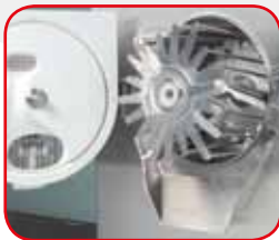
Special whisk for pâte à bombe, butter cream, meringue, etc. available for models 305, 457, 610, 1020