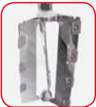
Three blades mixer in stainless steel with metal scrapers for a perfect scraping of the cylinder. Used for the production of creams, gelato etc...