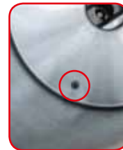
Probe in direct contact with the mix