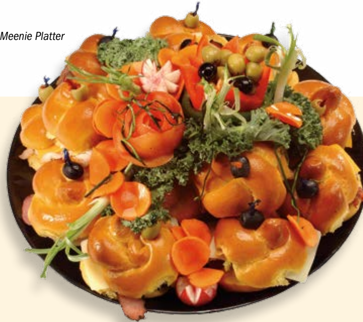
Eenie Meenie Platter