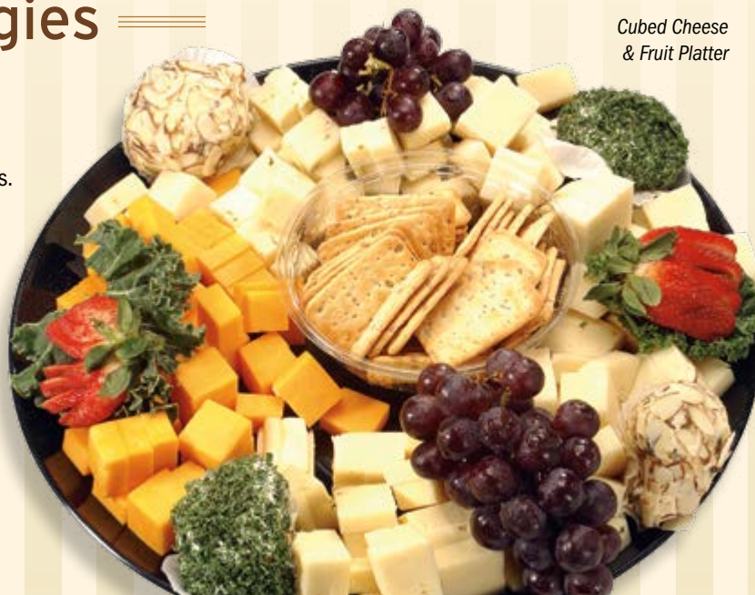
Cubed Cheese & Fruit Platter

Swiss, Muenster and provolone cheese beautifully displayed with gourmet crackers.