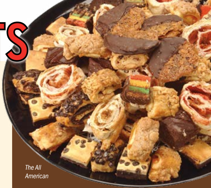
The All American