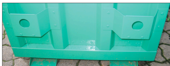
Handles, jack rings and forklift pockets (ventilation)