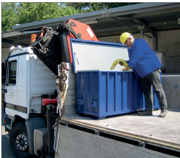
Typical on a building site: a WSB on a utility vehicle