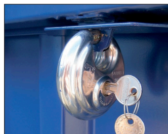
Security fitting with 2 discus locks