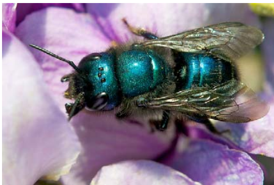
Blue Orchard Mason Bee Osmia lignaria