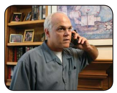
Call if sensitivity or discomfort continues