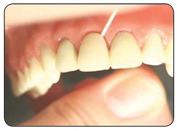
Superflossing a bridge