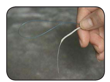
Superfloss showing stiff and fuzzy, tufted segments

Brush and floss your teeth and gums normally after each meal to keep your mouth healthy. Make sure to brush and floss the abutment teeth carefully to keep them strong and healthy.